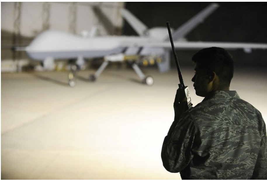
An MQ-9 Reaper in Iraq in 2008.

More secret bases. More and better unmanned warplanes. More frequent and deadly robotic attacks. Some five years after a U.S. Predator Unmanned Aerial Vehicle flew the type's first mission over lawless Somalia, the shadowy American-led drone campaign in the Horn of Africa is targeting Islamic militants more ruthlessly than ever.